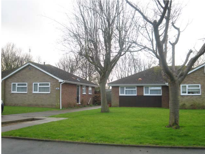
( example picture Park Road )